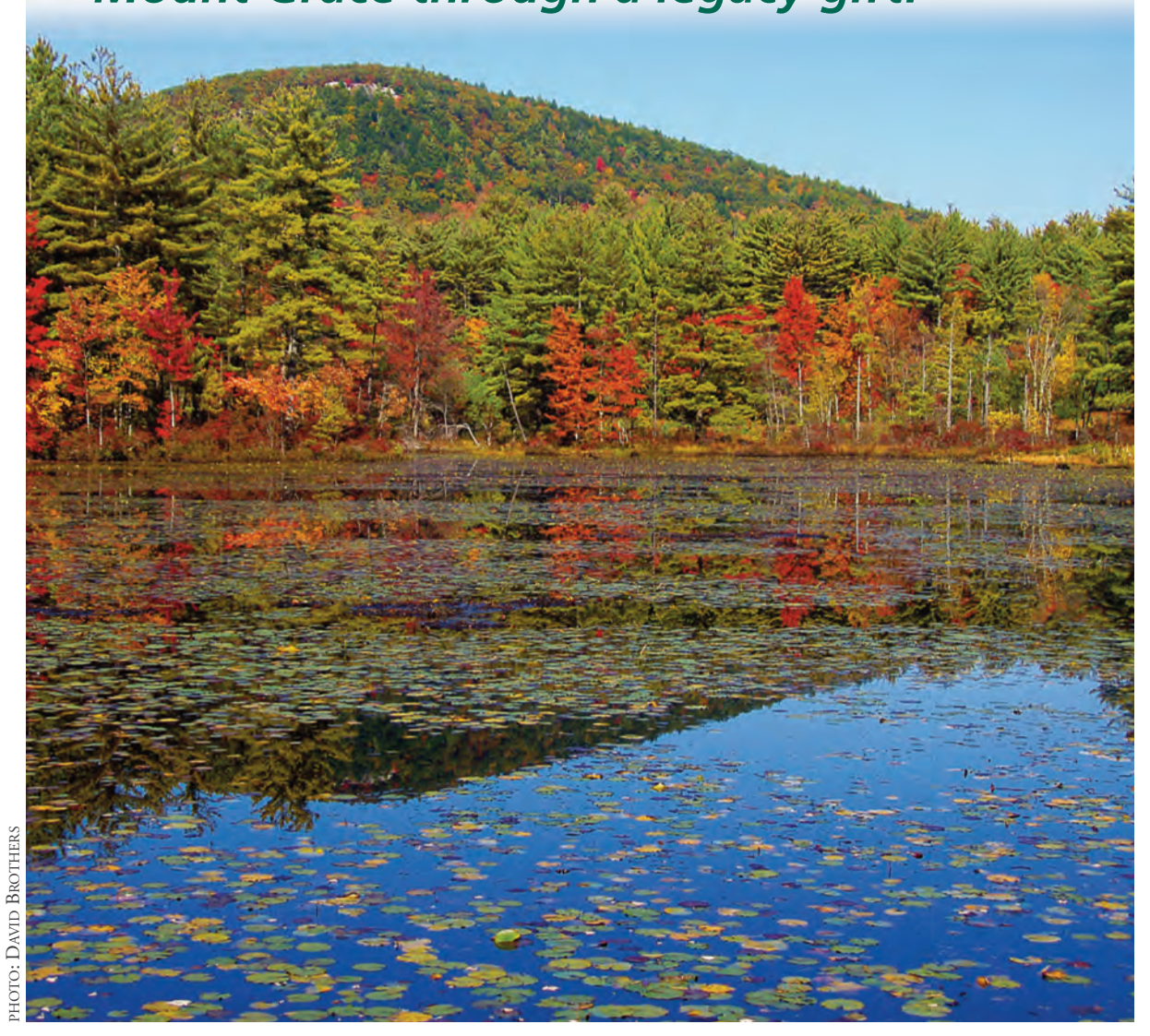
Mount Grace's work to protect Tully Mountain and the surrounding landscape began thanks to a bequest by Eleanor Whitmore. We invite you to leave a lasting legacy.

Now, more than ever, Mount Grace needs community support to protect cherished local landscapes. We invite you to support Mount Grace through a legacy gift.