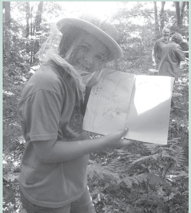
On the Skyfields tour, June 2007