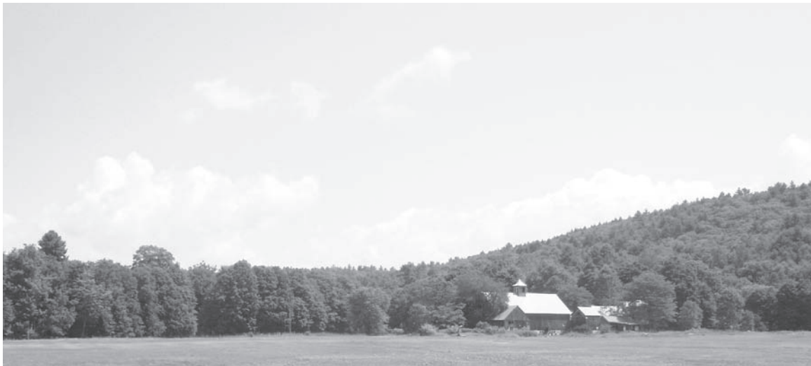
BASCOM HOLLOW FARM

C O N S E R V I N G T H E L O C A L L A N D S C A P E TM