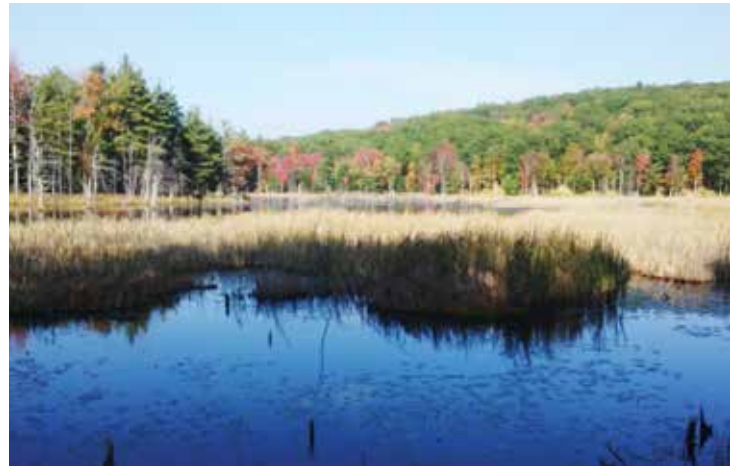
Baldwin Hill looks out on hundreds of acres of protected wetlands feeding Thousand Acre Brook.

It takes him three or four hours to traverse the trails and boundary lines of “his” 60 acres of forest and wetlands. After a few years of monitoring, he’s decided he prefers volunteering in the fall because it’s easiest to spot boundary markers—which can often be unobtrusive iron pins. Also, fewer bugs!