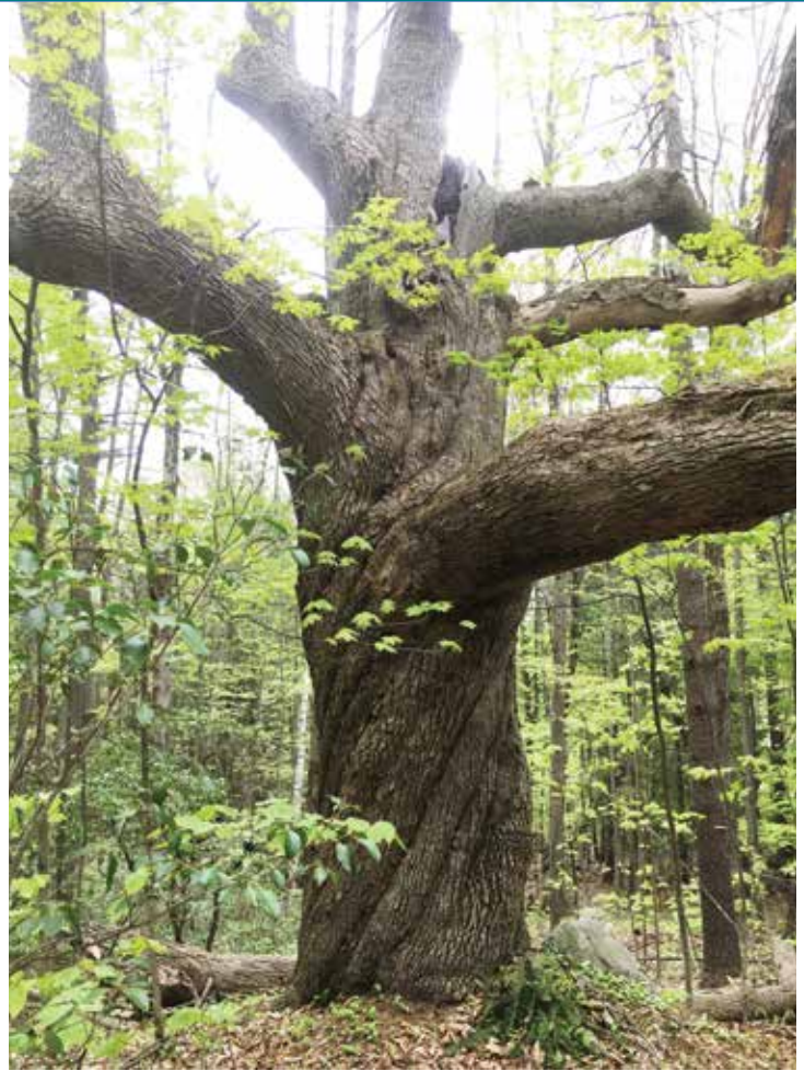
Large white ash tree on Sarah Kohler's land.

There's a 120,000-acre blanket of trees hugging the Quabbin