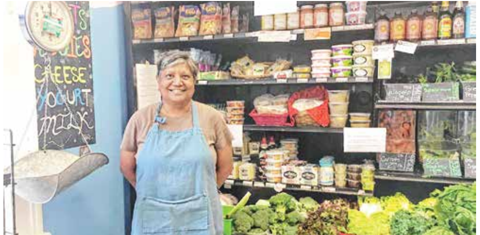
Stop by Quabbin Harvest (at 12 North Main Street in Orange) for the latest twist on local food from Nalini's Kitchen.