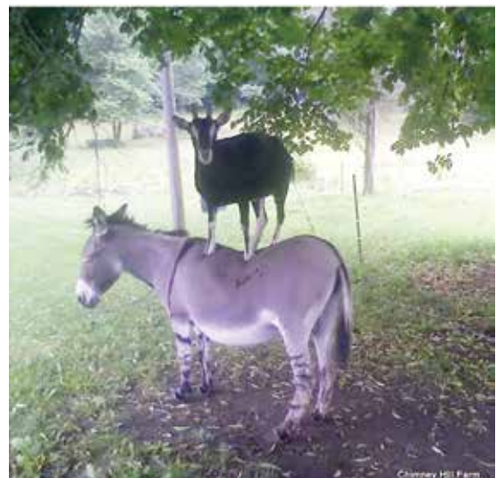
Partnership make anything possible!