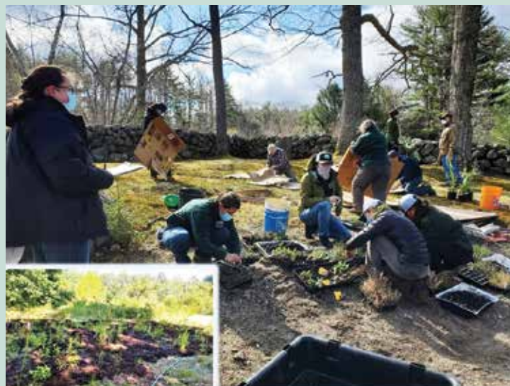
Earth Day pollinator project in progress; bottom left: Completed pollinator plot

The Community Engagement Program strives to connect the people of our region and beyond with our work and with the land. Through events, media, and youth education programs, we engage and expand our community in learning about, caring for, and protecting the land.