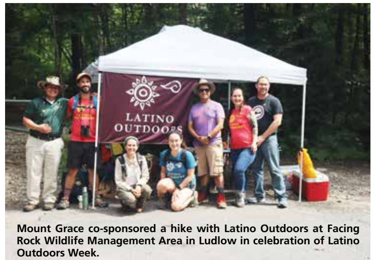
Mount Grace co-sponsored a hike with Latino Outdoors at Facing Rock Wildlife Management Area in Ludlow in celebration of Latino Outdoors Week.