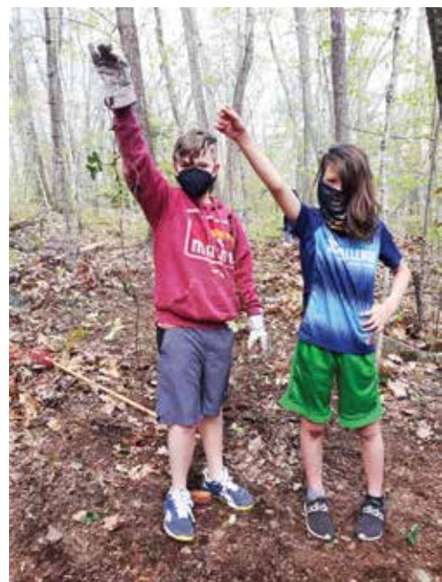
Students at Dexter Park School marvel at the root system of wintergreen ( Gaultheria procumbens ) while clearing the trail.

The Community Engagement Program strives to connect the people of our region and beyond with our work and with the land. Through events, media, and youth education programs, we engage and expand our community in learning about, caring for, and protecting the land.