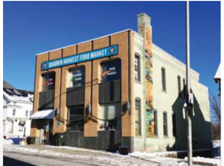
Decades of economic change have left their mark, but the building communicates a sense of optimism about the future of Orange and the region.

Mount Grace's land conservation work focuses mainly on the forested and farmed land surrounding the area's mill towns. But in 2014, a group from the co-op suggested the counter-intuitive idea of buying the former bank as a storefront for the fledgling food retail business. The land trust's leadership recognized how farmland protection, the local food economy, and the vitality of town centers like Orange's could all be interconnected and how this partnership could support the mission of encouraging land stewardship, benefiting the environment, the economy, and future generations. The rest, as they say, is history—or rather, it's part of the ongoing story of caring for the places we live—and eat!