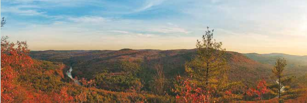
Panorama view of Bear Mountain in Wendell from the outlook on Hermit Castle Trail in Erving.