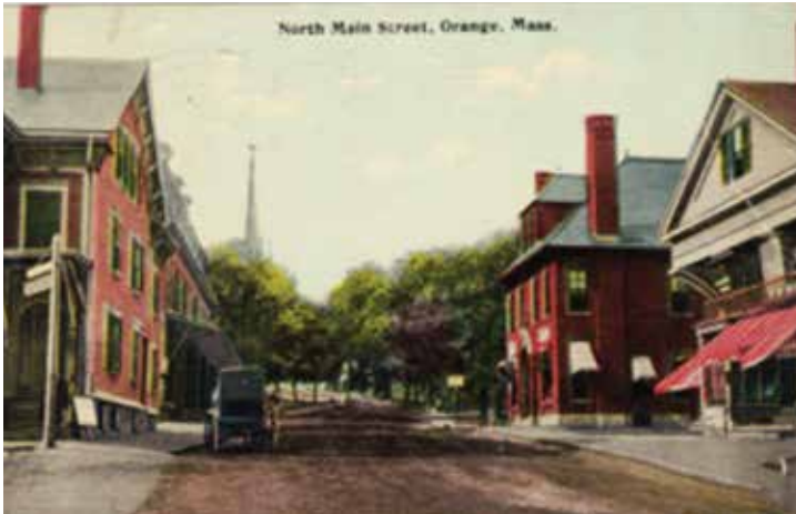
In this undated postcard, the building that now houses Quabbin Harvest is on the right, with white awnings.

The co-op's building at 12 North Main was built in 1881 for the Orange National Bank, back when every little town had multiple local financial institutions. The solidity and security of the former bank remain—drilling into the foot-thick walls for any reason is an all-day project! But comparing the undated postcard with a 2019 view shows signs of long economic decline as well as earlier efforts to revive Orange's commercial center after the loss of the industries that once fueled its prosperity.