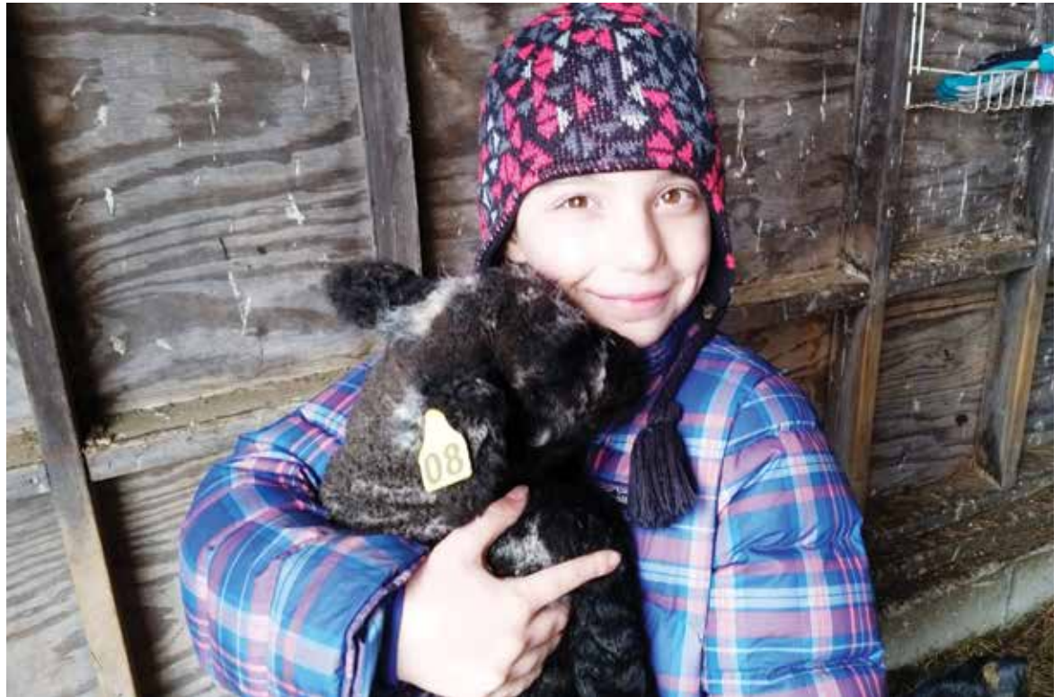
The Richardsons host students from the Village School at their farm every spring for lambing.