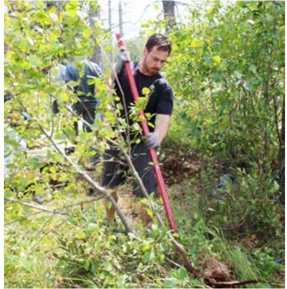
Fletcher goes mano a mano with some glossy buckthorn

I'm happy to report that we received a $15,000 grant and are now preparing for our projects this spring. The work at Eagle Reserve will remove glossy buckthorn which is displacing native vegetation on the wetland edge where birds forage and nest.