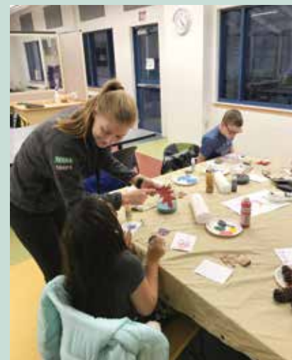
Youth Education Coordinators allow TerraCorps partners to support school programs, bringing conservation to the next generation.

With TerraCorps now positioned to support land trusts and urban agriculture throughout New England, it is a good time to take a moment to look back on Mount Grace's historic breakthrough for land conservation. We look forward to continuing our relationship with TerraCorps as a service site and partner for many years to come.